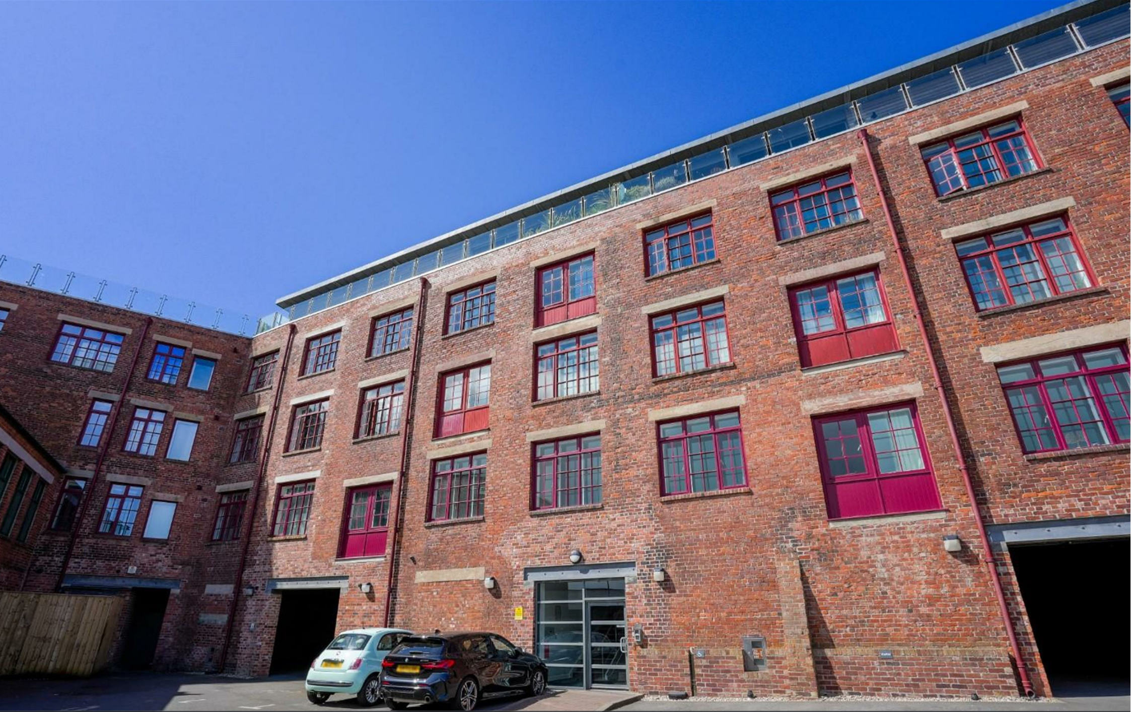
📍 Union Quay, North Shields NE30 1HB